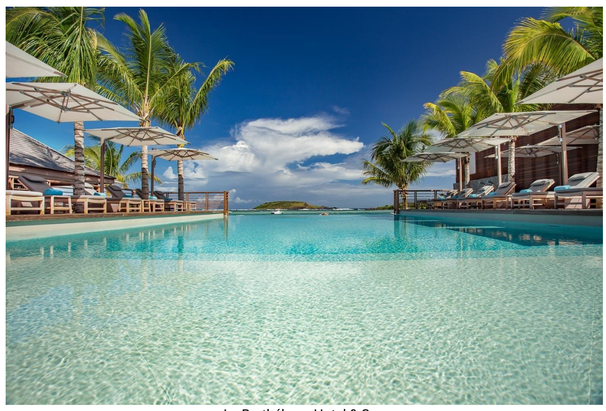
Le Barthélemy Hotel & Spa