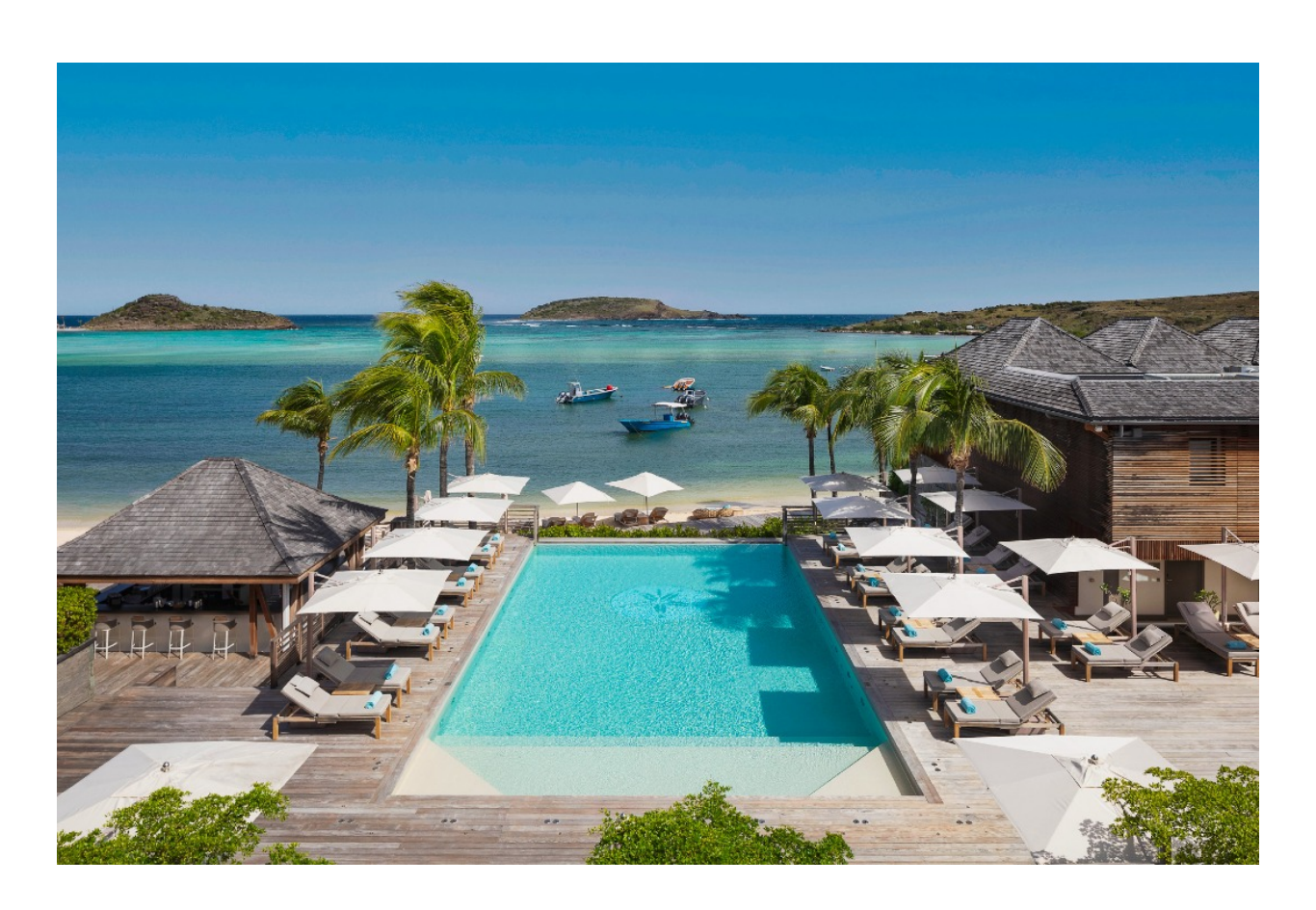
Le Barthélemy Hotel & Spa