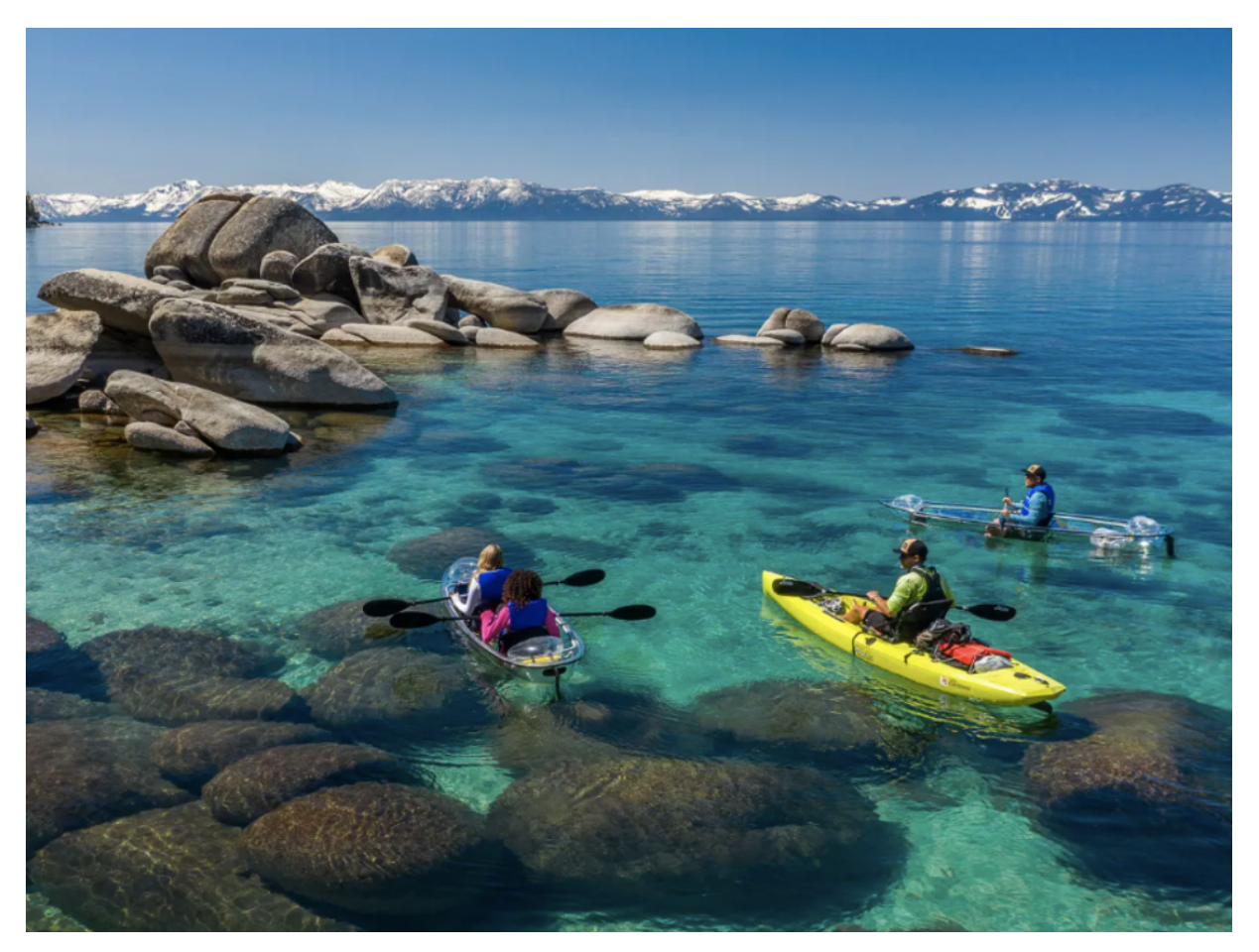
Clearly Tahoe clear-bottom kayaking CLEARLY TAHOE

If you've ever been to Lake Tahoe, you're probably already well-acquainted with the impossible blue waterway. "A visit to Lake Tahoe, with its crystal-