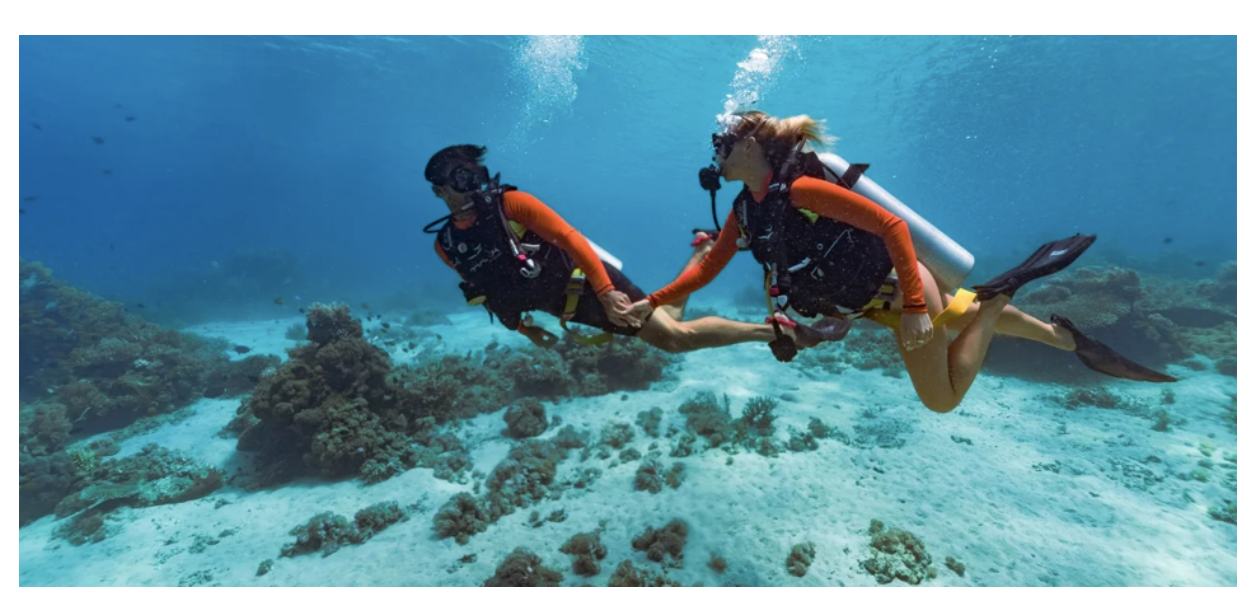
Diving excursion with Prana by Atzaro PRANA BY ATZARO

Raja Ampat in Indonesia is one of the most famous diving destinations; it has some of the greatest biodiversity in the world and the sparkling blue waterways are relatively easy to navigate as a beginner.