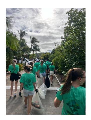
Island Clean up day by Le Barth's employees