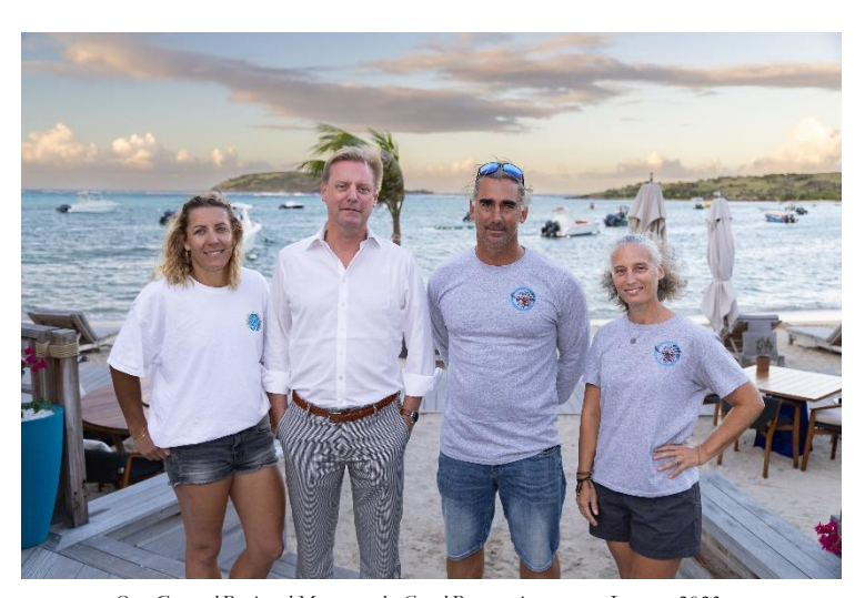
Our General Regional Manager & Coral Restoration team – January 2023

Guided by this philosophy, we partner with Coral Restoration, an association committed to the restoration of coral reefs and the preservation of the environment.