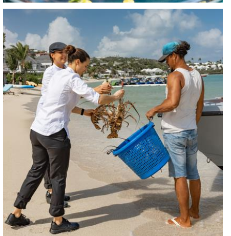
Reception of lobsters served by our local fishermen – January 2023