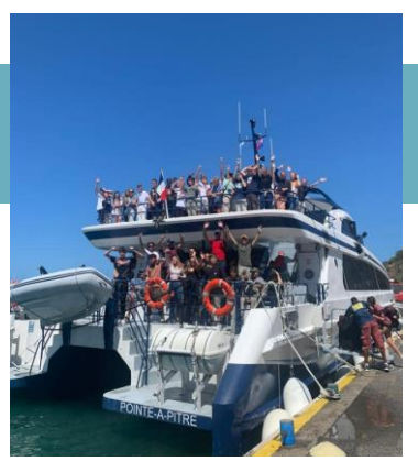
Official sponsor of the public school's trip to mainland France for a ski week in the Alps and a cultural week in Paris – March 2024