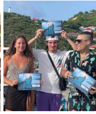
Employee Training & Awareness with Coral Restoration – November 2022